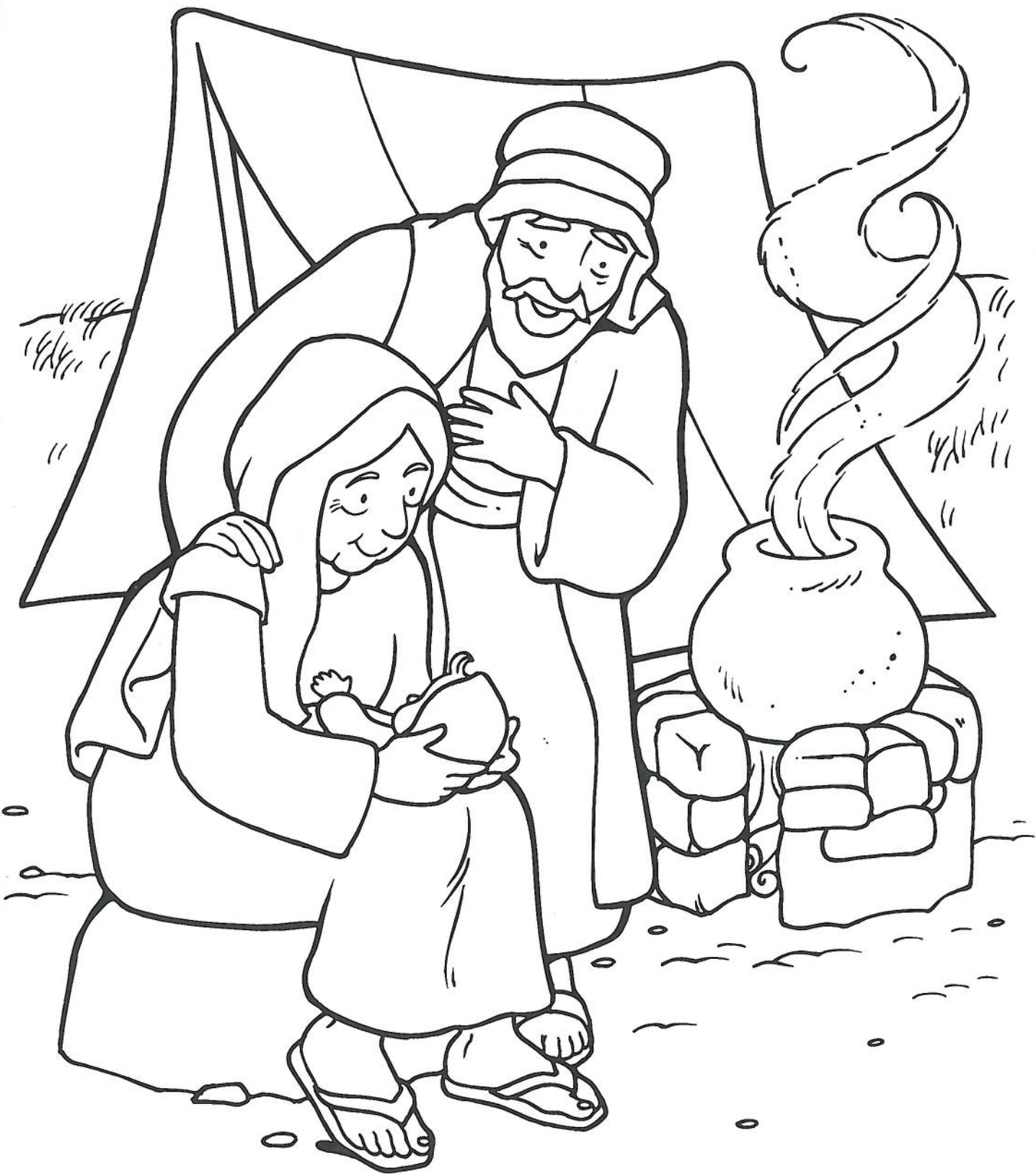
Abraham and Sarah Have a Baby