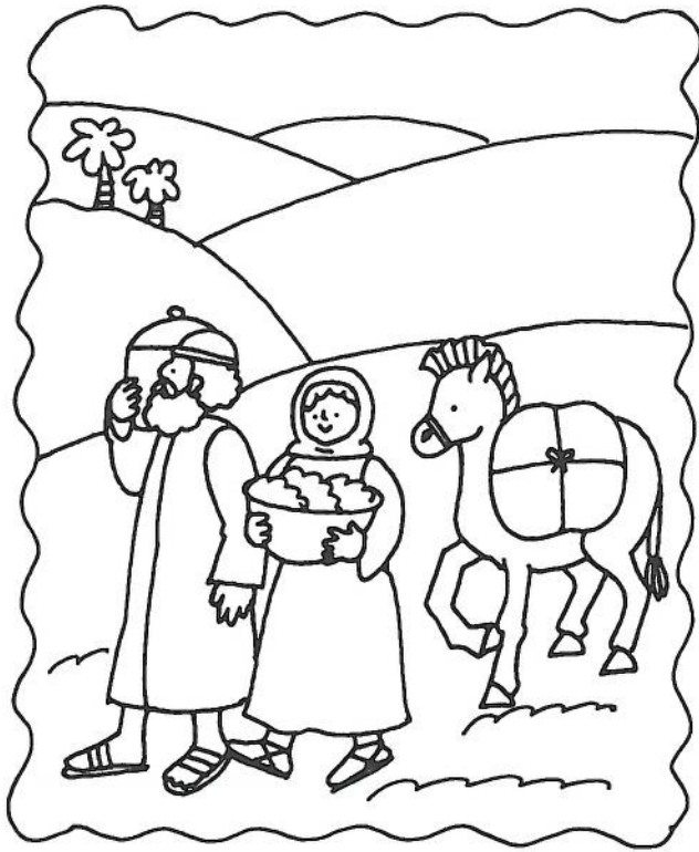
Abram and Sarai traveled far.