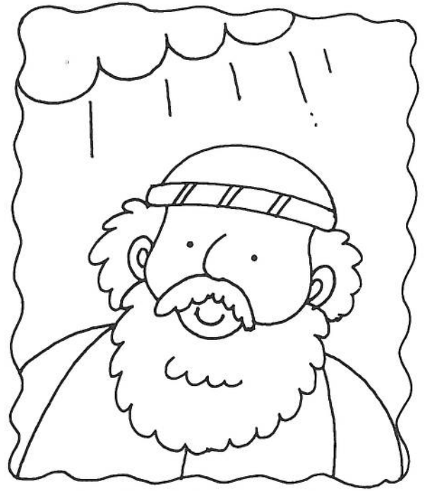
The Lord appeared to Abram again and said, "I will give you and your children this land."